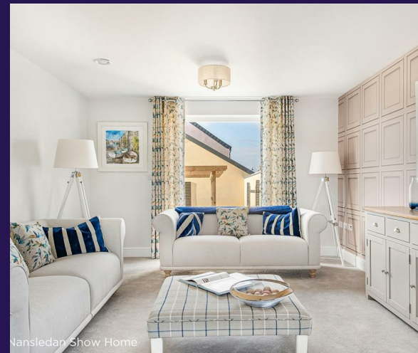
Nansledan Show Home