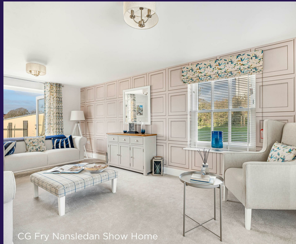
CG Fry Nansledan Show Home