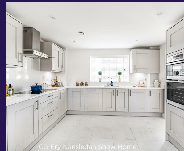
CG Fry Nansledan Show Home